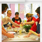
The best training day ever!