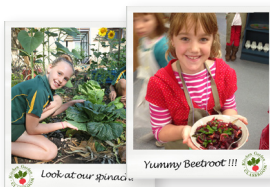
Look at our spinach...

The Victorian Pleasurable Food Education Package includes over $1500 worth of value in professional development, educational resources and support for only $550.