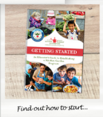
Find out how to start...