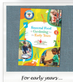
For early years...