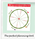
The perfect planning tool